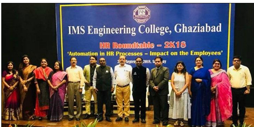
A group photograph of all the panelists & the faculty of MBA at the end of the session