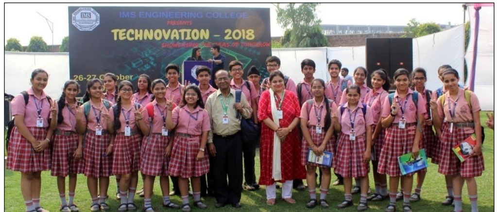
Students from schools were also invited so that they can find the motivation in the science field