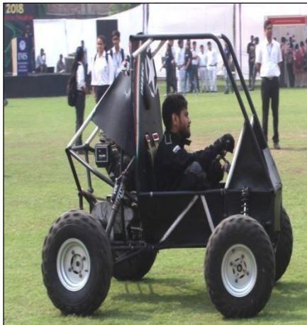
A student presenting a demo of his model to other students