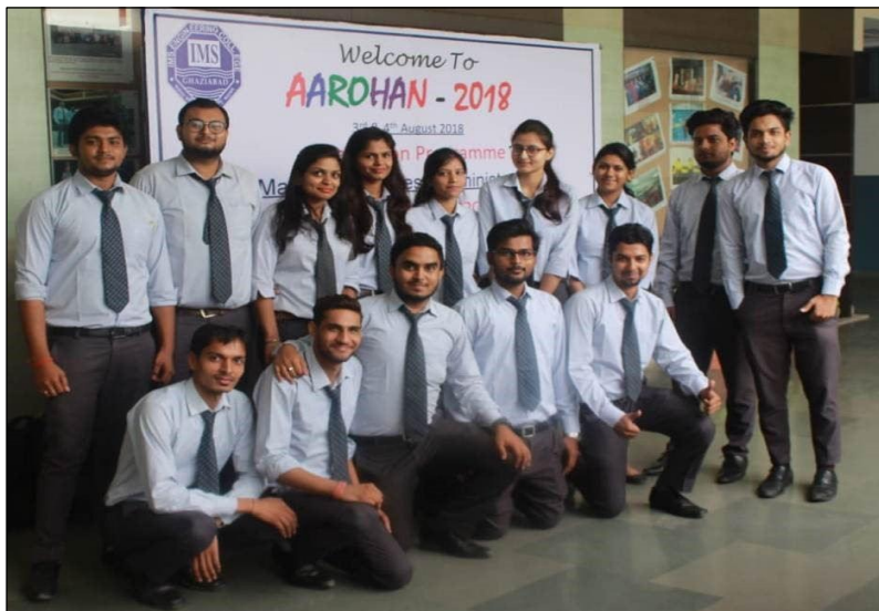
All other participants in the event, organizers and student volunteers together