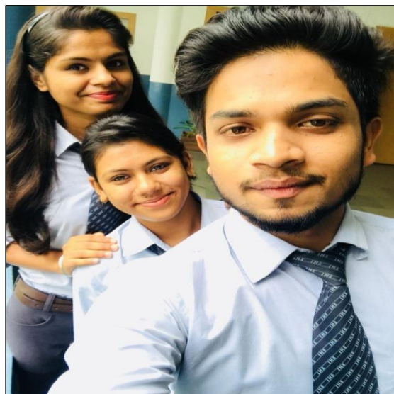
Along with knowledge, learning, management experiences students having lots of fun