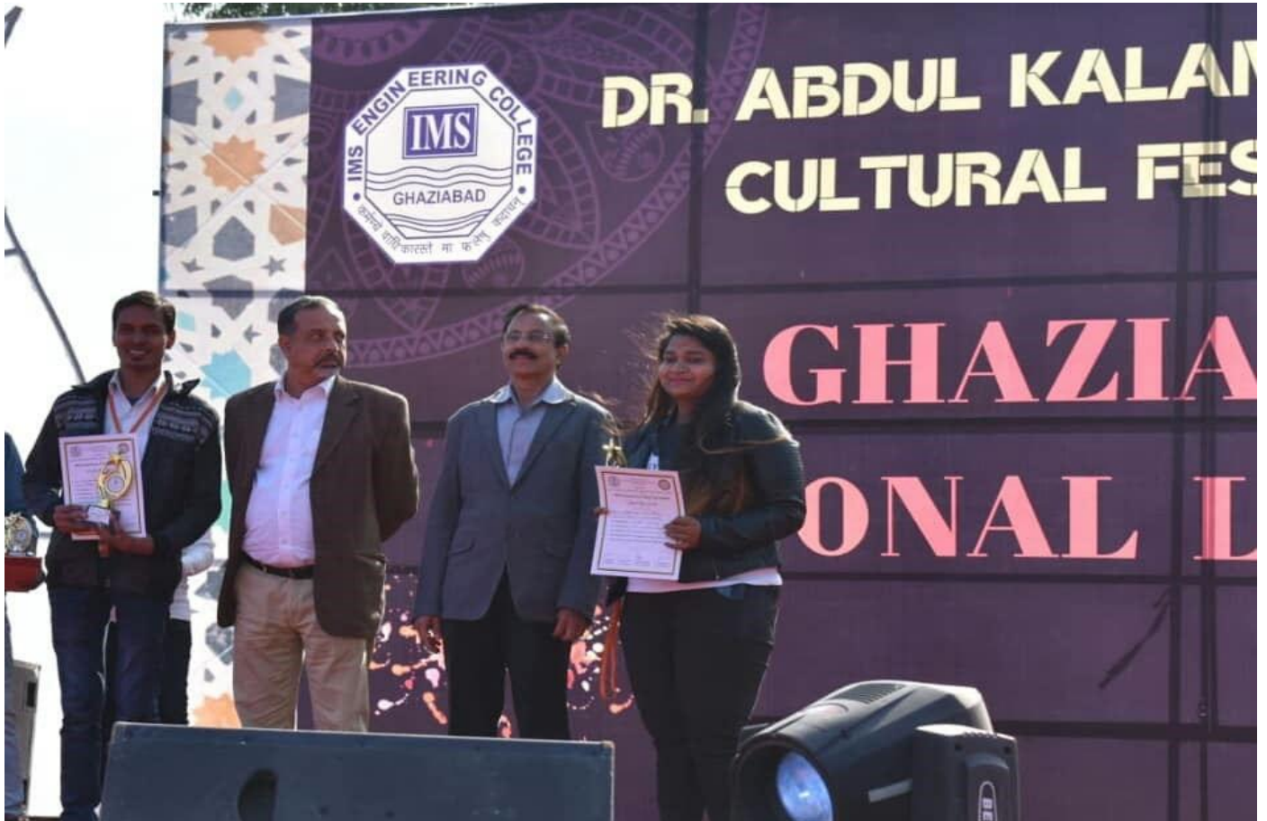
Dean sir & Director sir presenting the winners with the award in the award ceremony

A sample of talent in the festival made by the MBA student presenting their creative skills