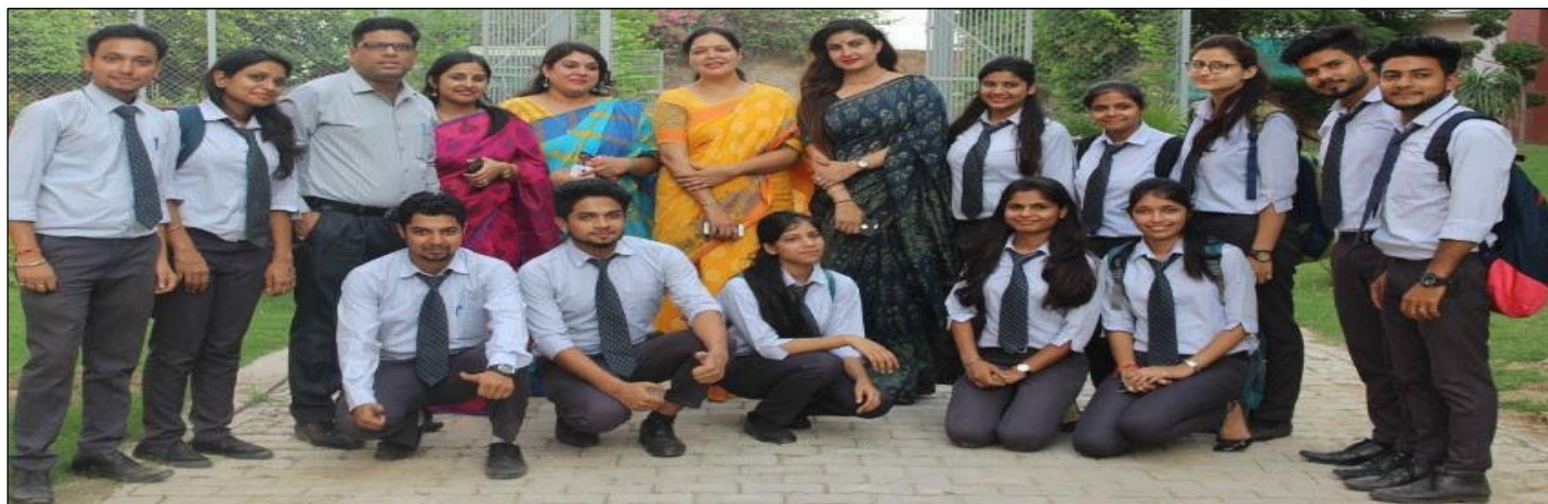
Strong bond between teachers and students creates a positive environment and have a long lasting effect in professional and personal life.