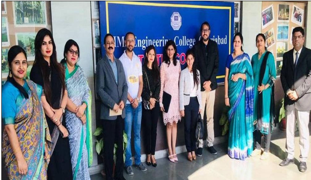
A group photo of all the faculties & the guest lecturers at the end of the session