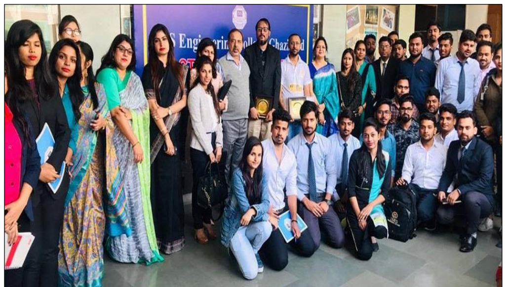
A group photograph of the students & the guests together before they take their leave