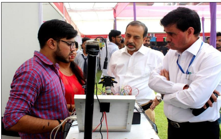
Vice Chairman sir & Director sir having a conversation with a student about his project