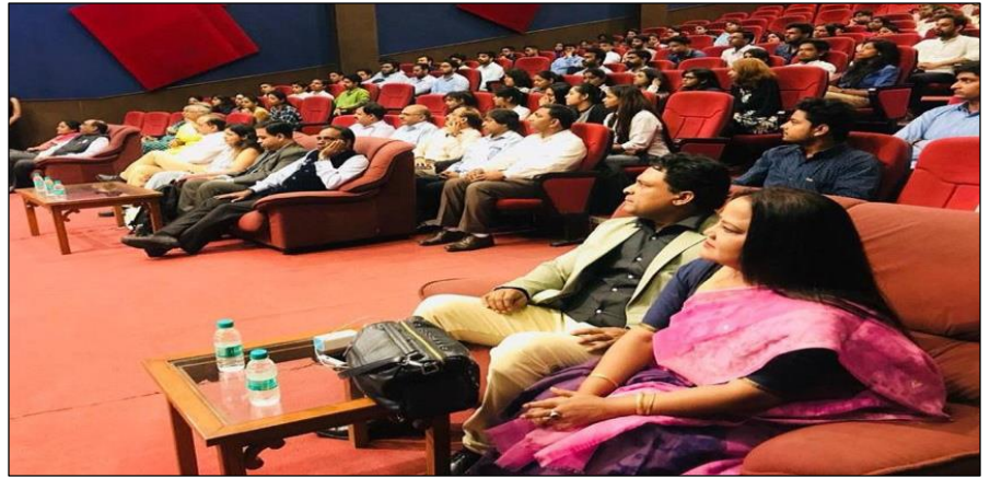
Panelists having an interesting interaction with the faculty & the students where lots of questions were asked & an- swered