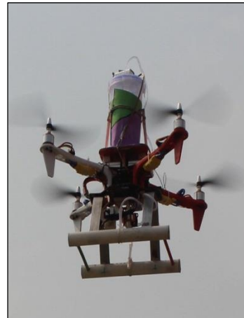
A good example of an innovative drone model in its flying form